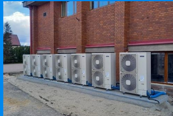
Hitachi Yutaki S – cascade Home installation