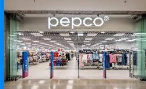
PEPCO stores across Europe