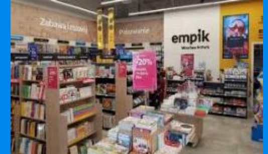
EMPIK store network