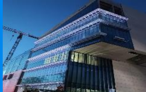
ZUSOK Waste Incineration Plant, Warsaw