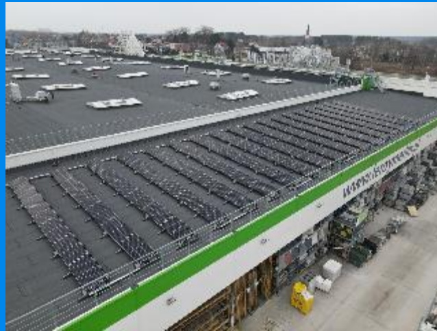
Leroy Merlin 12 installations of 50 kWp each