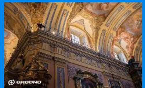
Basilica in Kalwaria Pałacowska