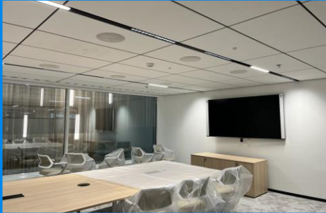
City Bank Handlowy, Warsaw