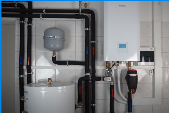
Auratsu Split Home installation