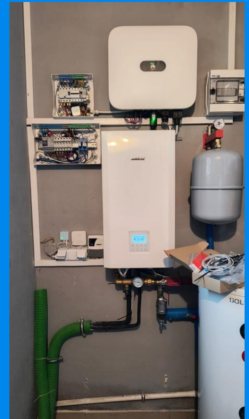
Auratsu Split Home installation