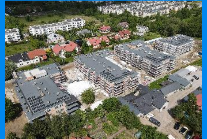
Ostródzka Estate in Warsaw 6 installations of 10 kWp each