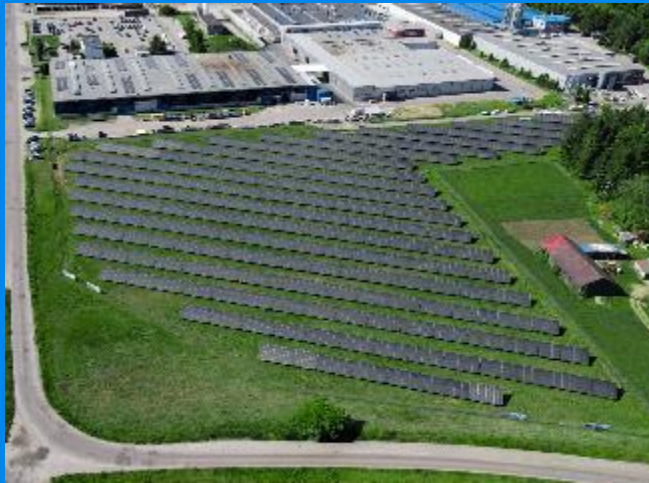
2 MW solar farm 5,838 modules

As a PV market leader in Poland since 2008, we've completed thousands of projects. Working with us means real support for your business growth. Our clients gain an edge, save time, and always deliver top quality.