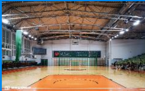
KGHM BC Sports Hall, Polkowice