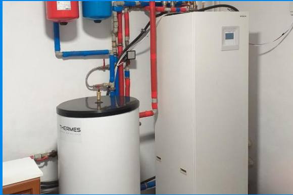
Hitachi Yutaki SCombi Home installation